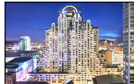
San Francisco Marriott Marquis